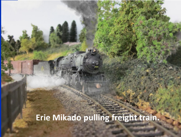
Erie Mikado pulling freight train.